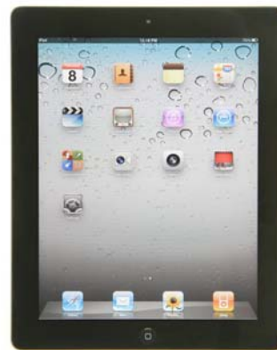
iPad/iPad 2 Trade Dress